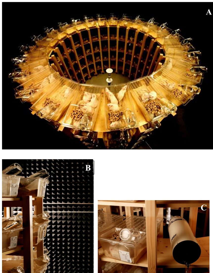
Fig. 1. RI study on 1.8 GHz base station RFR: exposure system. The rat cages were located in wooden circular-shaped devices, as in a sort of condominium. Each single exposure device served at least 400 rats (A). The exposure rooms were totally shielded in order to minimize the effect of field non-uniformity due to reflection and consequent interference caused by the walls (B). Detail of the RFR feedback probe used to measure the field (TESY2001 field sensor) and of the animal cage with methacrylate markers, cover and mangers (C).

produce the following functions: a) generate a GSM signal, with complete channel simulation capability and frequency preselection; b) signal pre – amplifications – age, with gain regulation input; c) final stage, dimensioned for a total power output of plus 50 dBm; d) reference signal loop back input, for closed loops power control; the control was closed at the antenna connection level in order to stabilize at the maximum level the radiation unit RF feed; e) power supply unit; f) cooling unit for continuous use of the device.